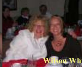
Wilson White Company